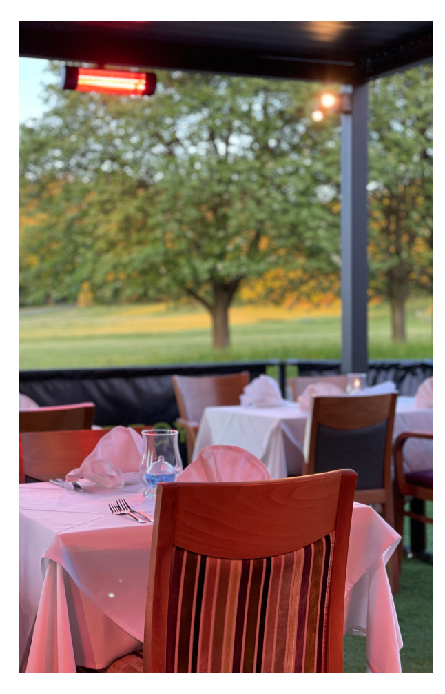
Al fresco dinning at viceroy

An extension to both the car park and the building has created additional capacity, a new private dining room with specialist conferencing facilities. It was part funded by the European Agricultural Fund for Rural Development